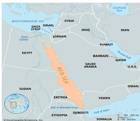
Figure1. Red Sea