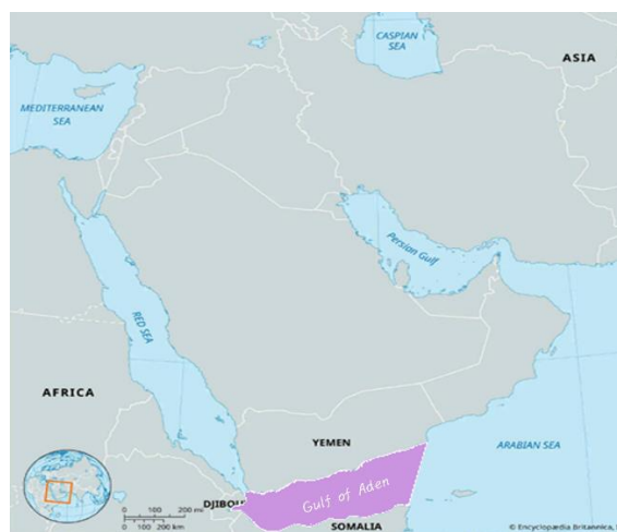
Figure2. Gulf of Aden