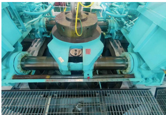
Picture Captured from a CCTV Camera in front of the rudder in steering flat