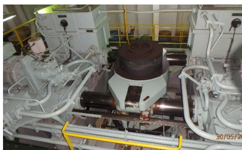
View from the Proposed location FWD on the Phones and Gyro repeater panel