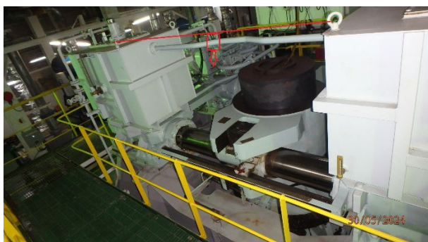
Proposed location AFT on the LO tanks