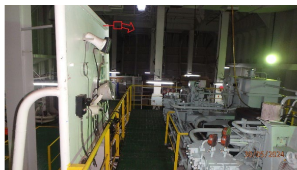
Proposed location of camera on the Phones and Gyro repeater panel