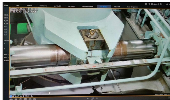
Sample of real-time feed to a CCTV Monitor in the wheelhouse.